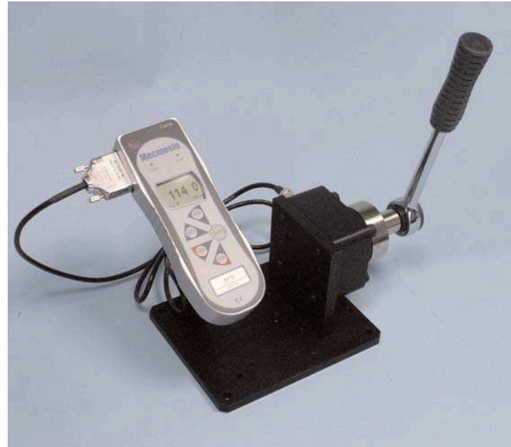
TWC shown testing a mechanical torque wrench