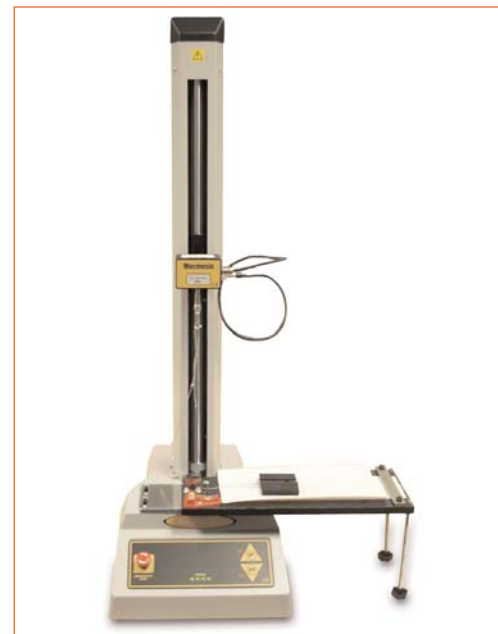
Coefficient Of Friction Test System

Mecmesin Limited Newton House, Spring Copse Business Park, Slinfold, West Sussex, RH13 0SZ, United Kingdom e: sales@mecmesin.com t: +44 (0) 1403 799979 f: +44 (0) 1403 799975